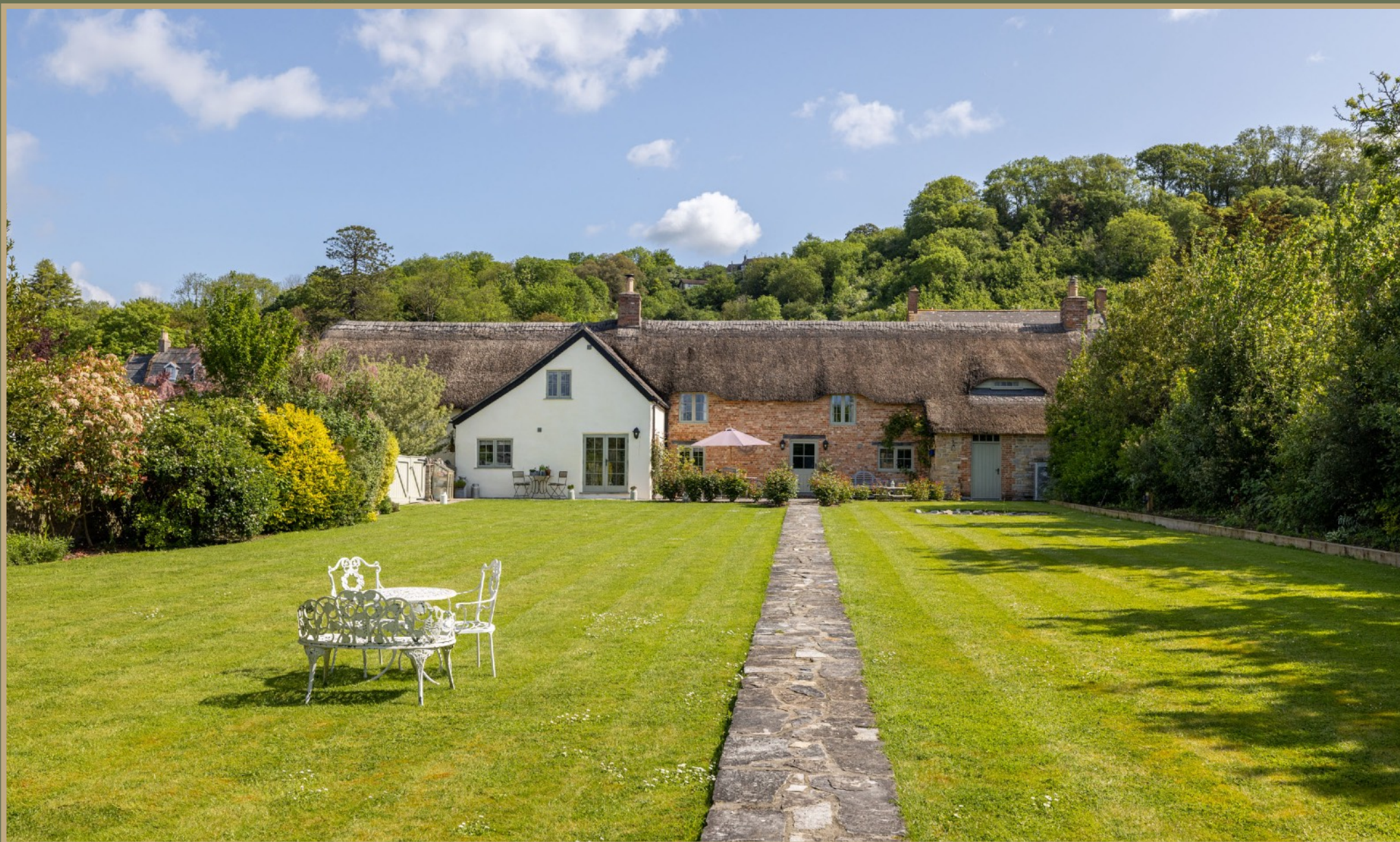
CANTERBURY FARM, ALLER, LANGPORT, SOMERSET, TA10 0QW