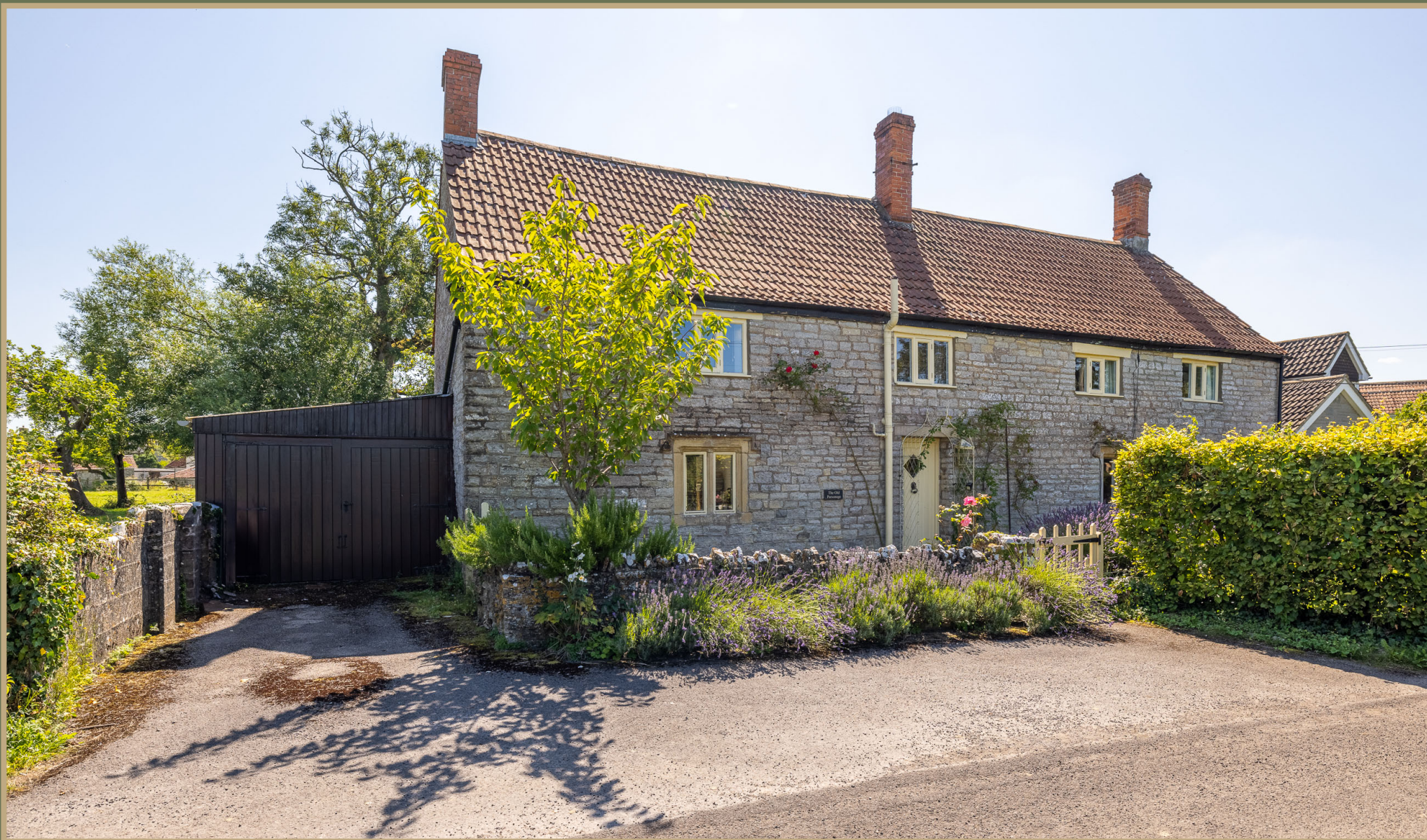
The Old Parsonage, Teapot Lane, Baltonsborough, BA6 8QE