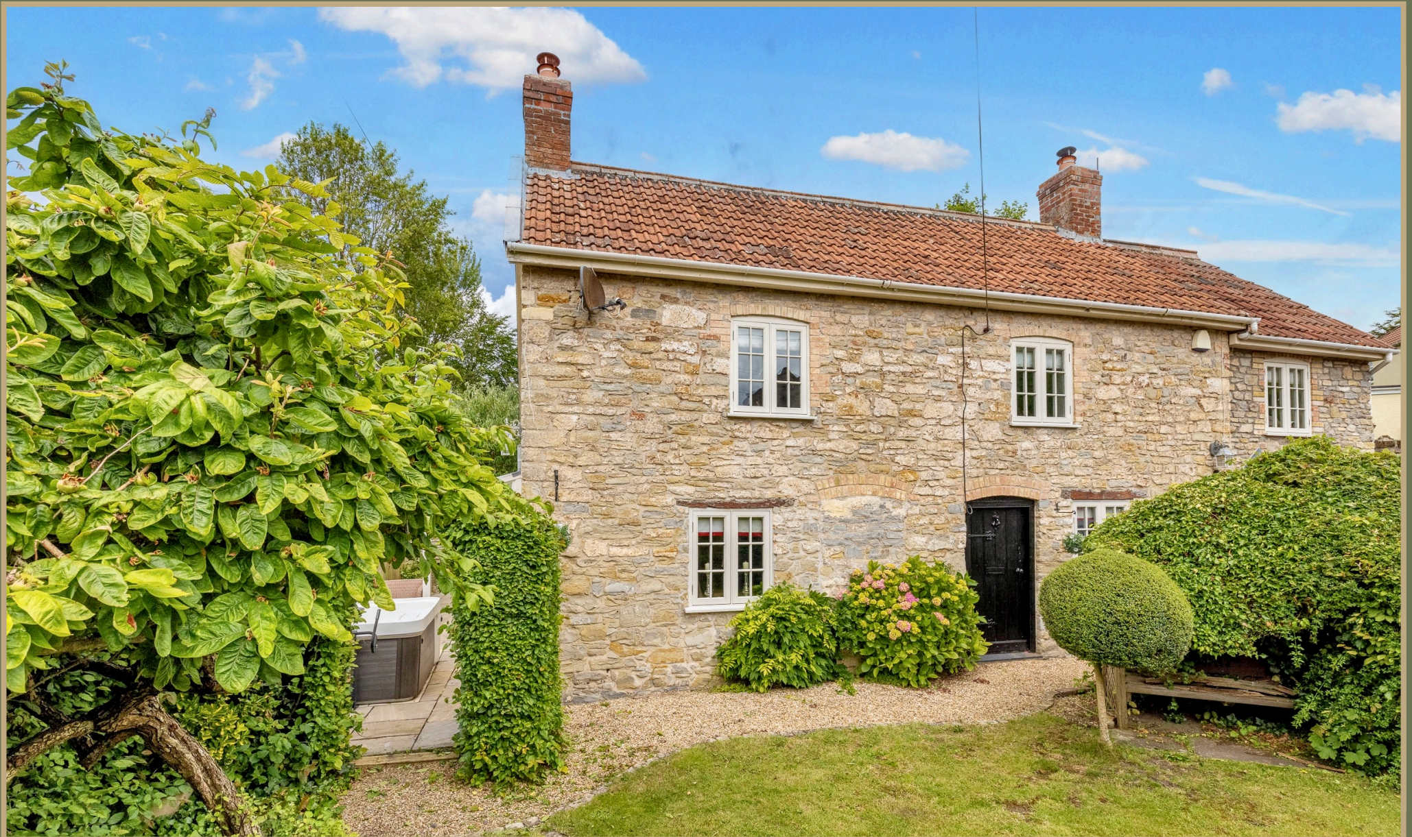
COSY COTTAGE, GUILDHALL LANE, WEDMORE, SOMERSET, BS28 4AL