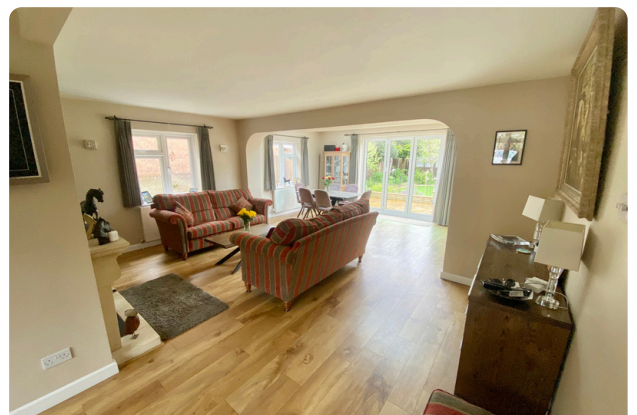
Open Plan View