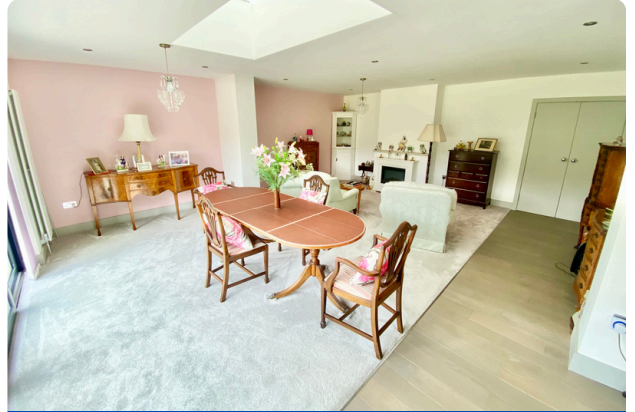
Lounge / Dining Room