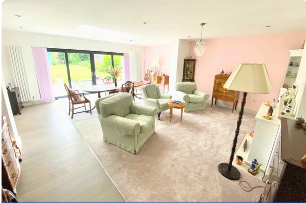
Lounge / Dining Room