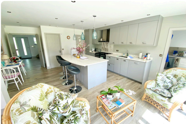
Kitchen/ Breakfast Room