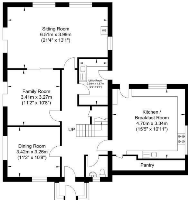
Ground Floor Approximate Floor Area 1043.77 sq ft (96.97 sq m)