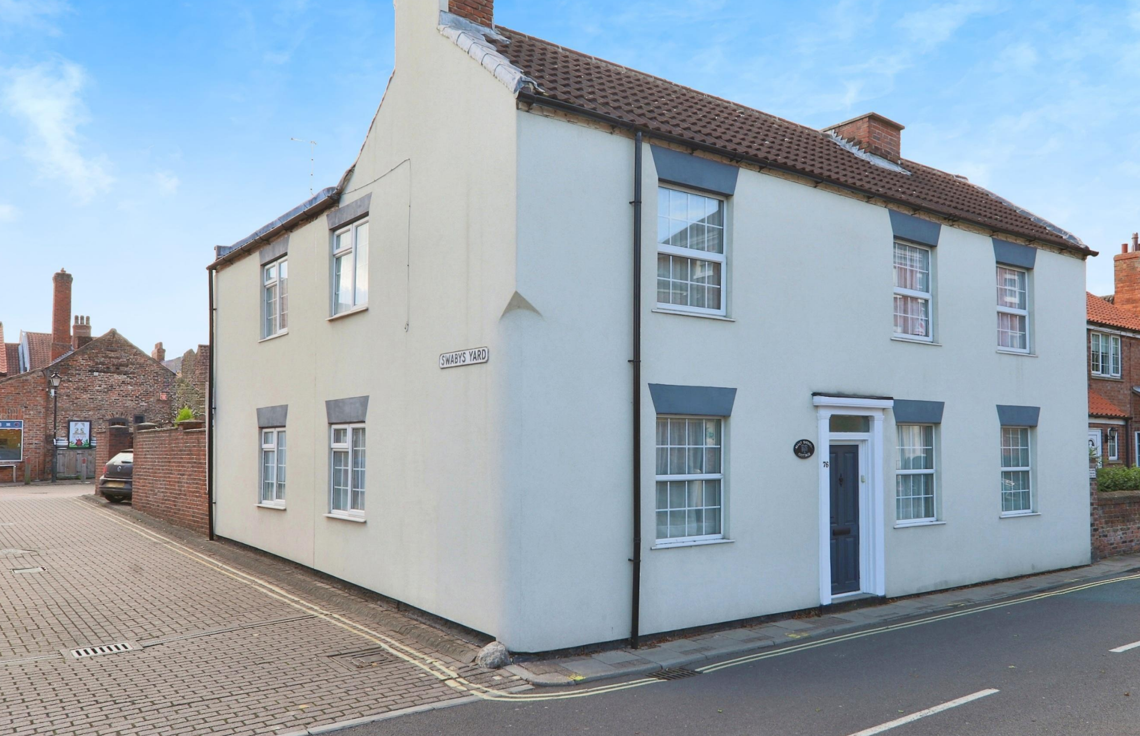
Malt Shovel Cottage, 76 Walkergate, Beverley, East Yorkshire, HU17 9ER