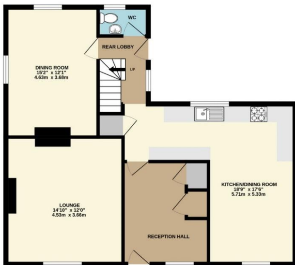
GROUND FLOOR 808 sq.ft. (75.0 sq.m.) approx.