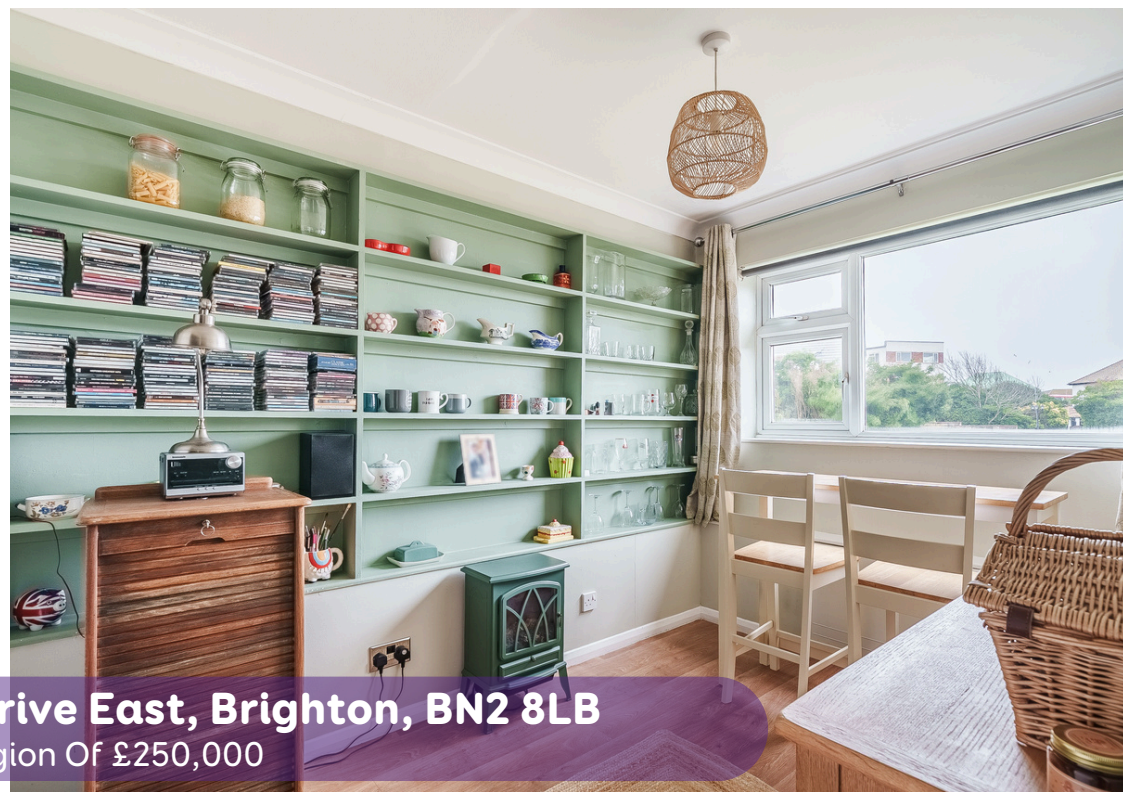
Duncan Court, Chichester Drive East, Brighton, BN2 8LB Offers In The Region Of £250,000