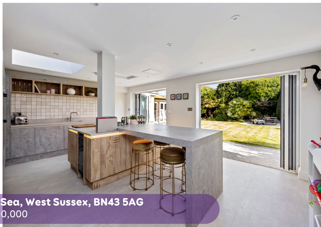
18 Mill Lane, Shoreham-By-Sea, West Sussex, BN43 5AG £1,100,000