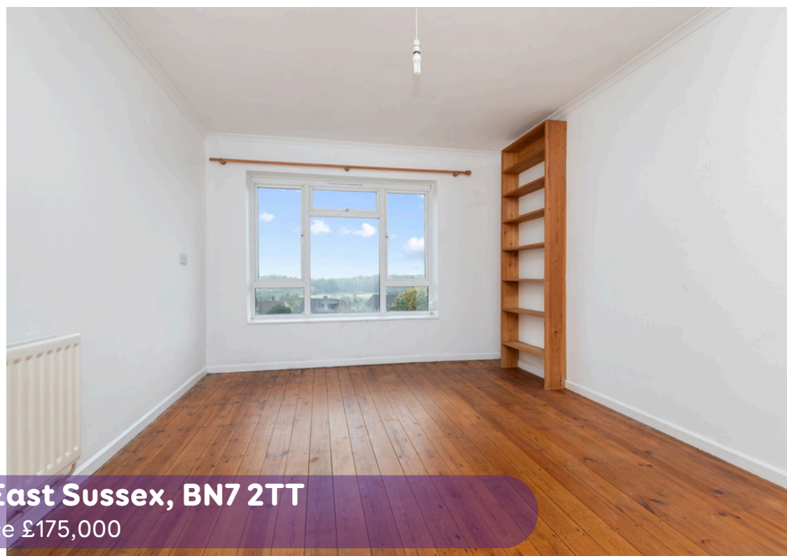
Blois Road, Lewes, East Sussex, BN7 2TT Asking Price £175,000