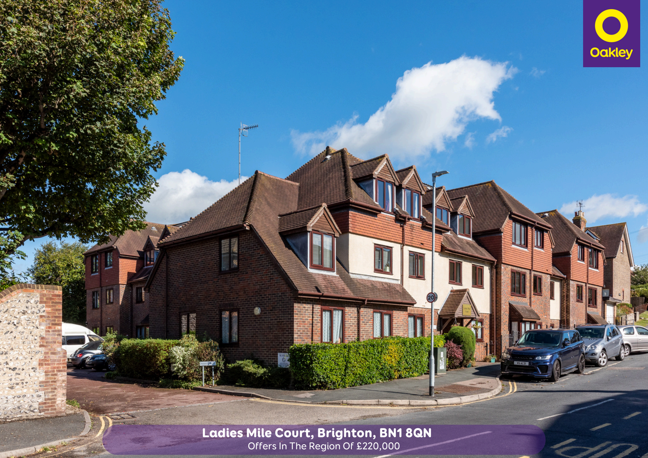
Ladies Mile Court, Brighton, BN1 8QN Offers In The Region Of £220,000