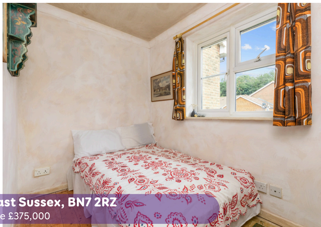
Court Road, Lewes, East Sussex, BN7 2RZ Asking Price £375,000