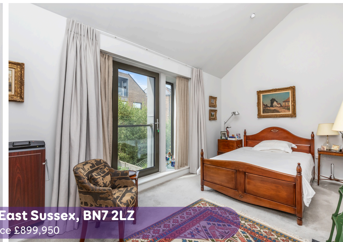
5 Styles Field, Lewes, East Sussex, BN7 2LZ Asking Price £899,950