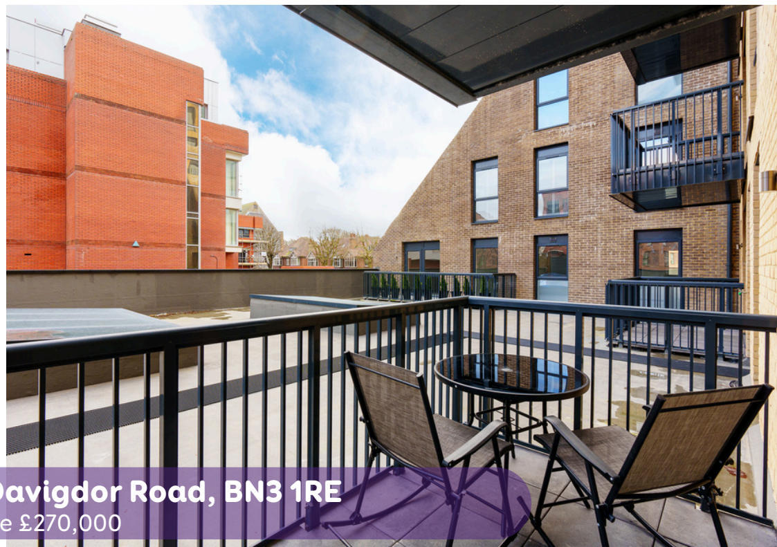
Gradino Apartments, Davigdor Road, BN3 1RE Asking Price £270,000