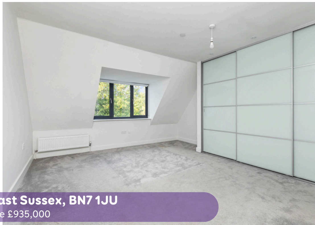
Bell Lane, Lewes, East Sussex, BN7 1JU Asking Price £935,000