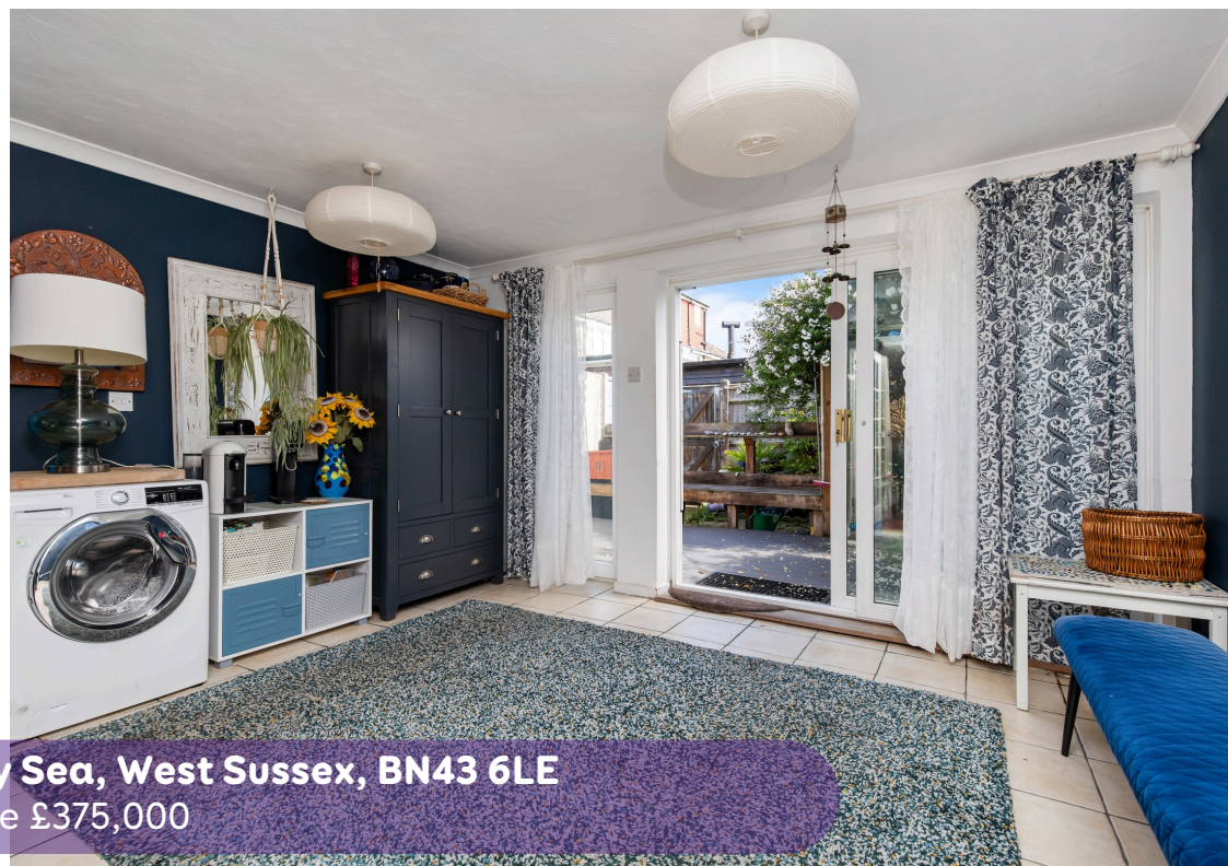
Chiltern Close, Shoreham by Sea, West Sussex, BN43 6LE Guide Price £375,000