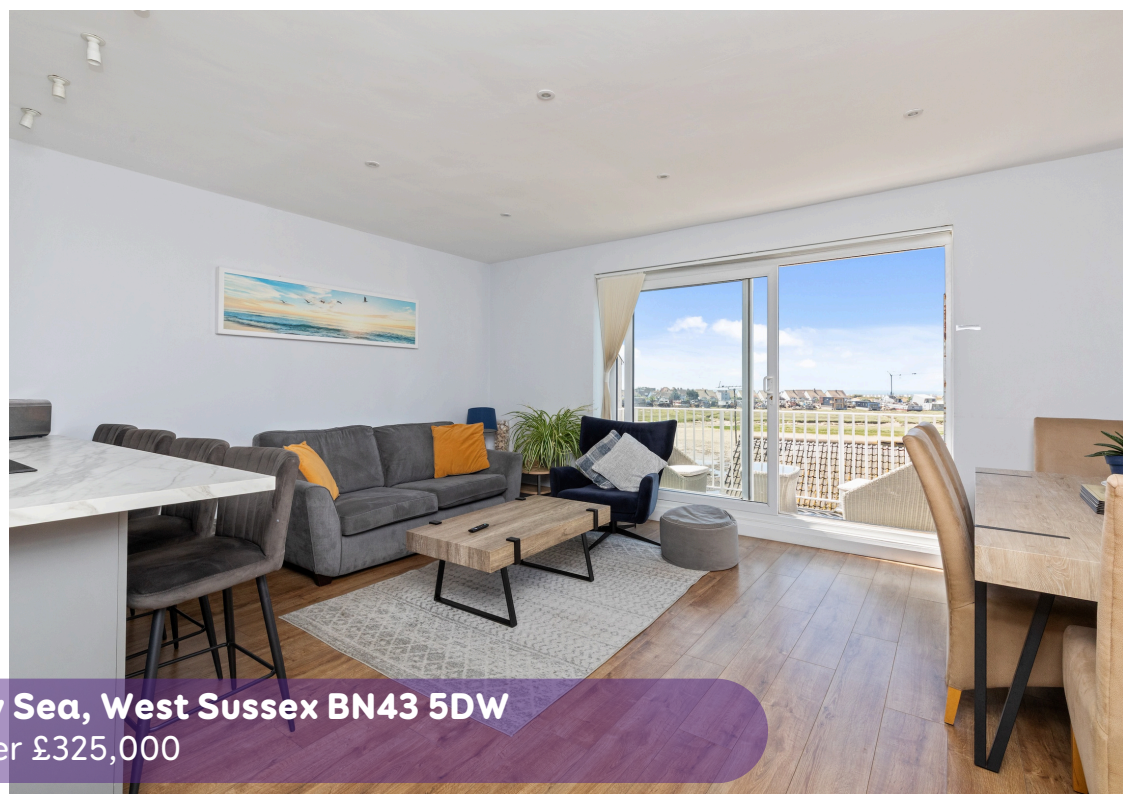
Riverside House, Shoreham By Sea, West Sussex BN43 5DW Offers Over £325,000