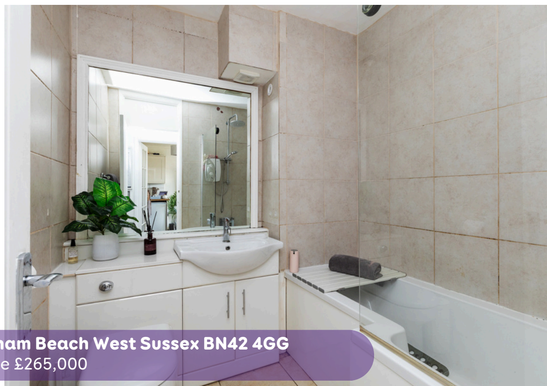
South Point, Emerald Quay, Shoreham Beach West Sussex BN42 4GG Guide Price £265,000