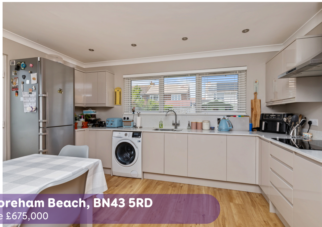
14 The Marlinespike, Shoreham Beach, BN43 5RD Guide Price £675,000