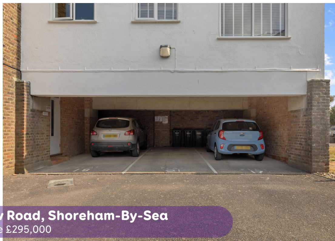
Swanborough Court, New Road, Shoreham-By-Sea