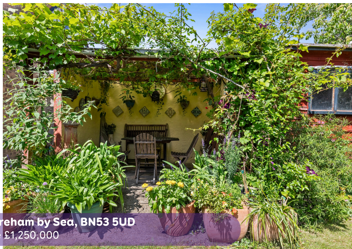
Buckingham Road, Shoreham by Sea, BN53 5UD Guide Price £1,250,000