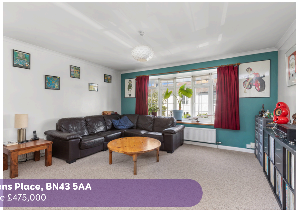
South House, Queens Place, BN43 5AA Guide Price £475,000