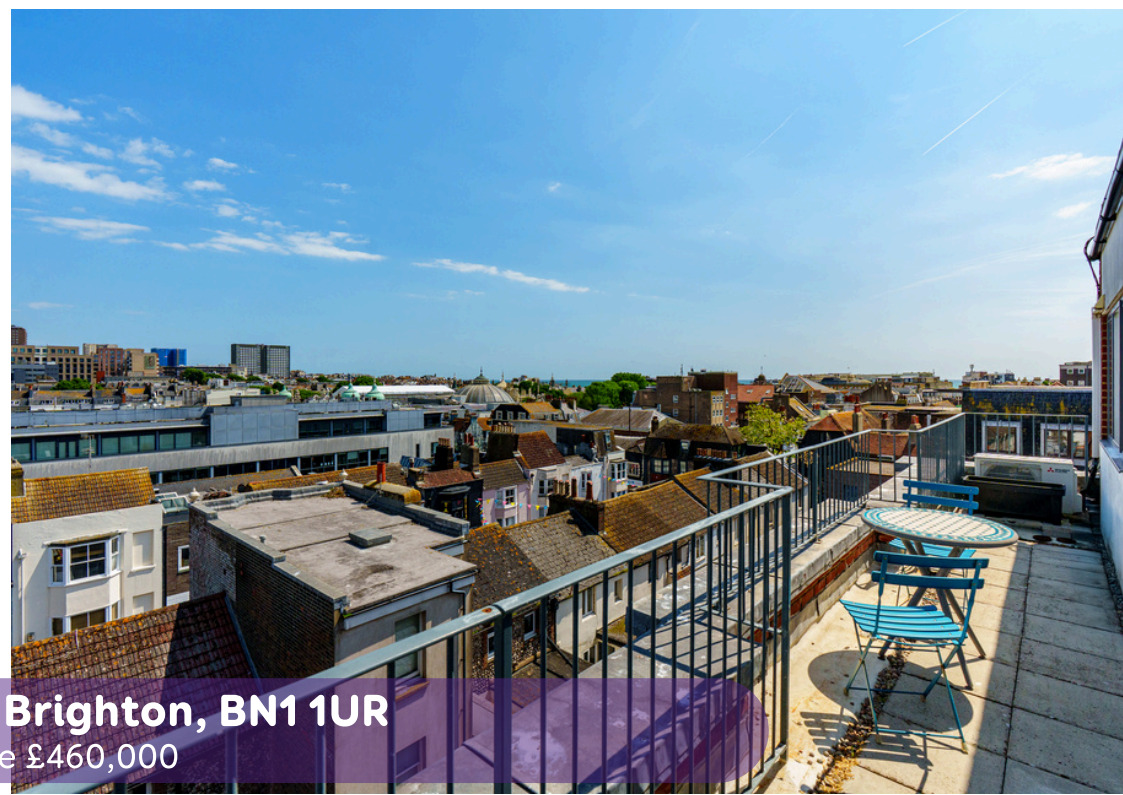
Tichborne Street, Brighton, BN1 1UR Asking Price £460,000