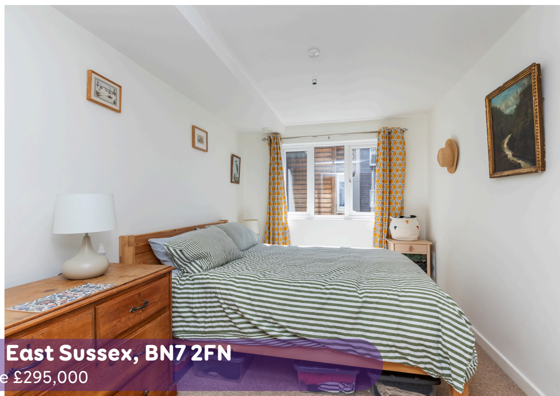
Clayhill Court, Lewes, East Sussex, BN7 2FN Asking Price £295,000