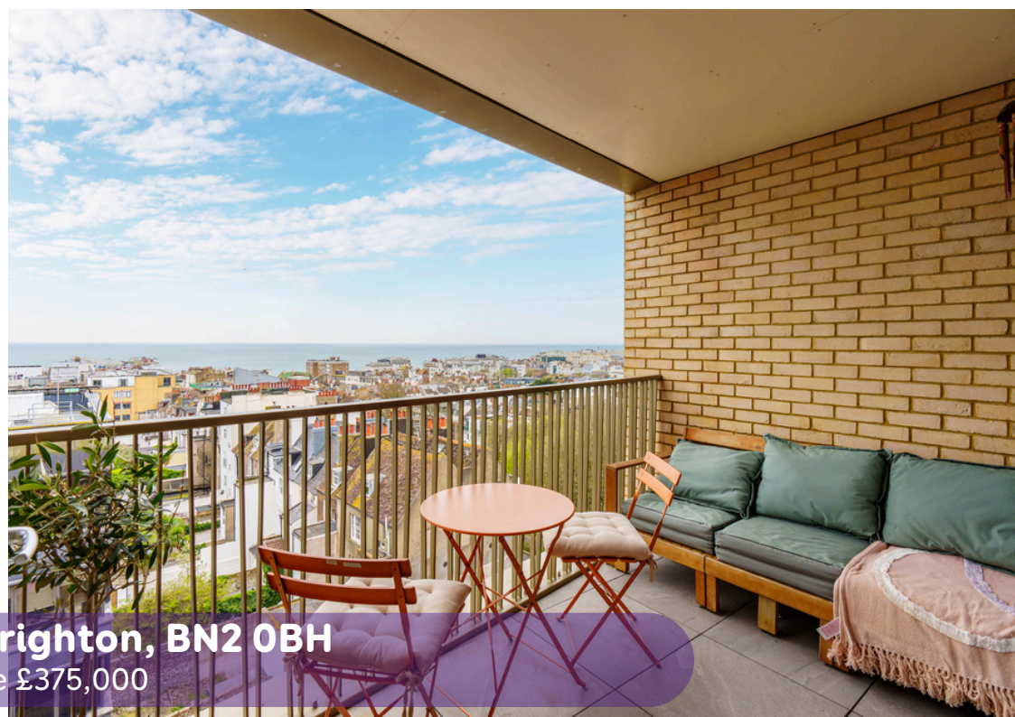
Edward Street, Brighton, BN2 0BH Asking Price £375,000