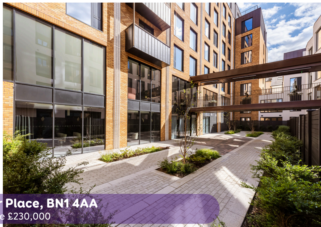
ROX, Gloucester Place, BN1 4AA Asking Price £230,000