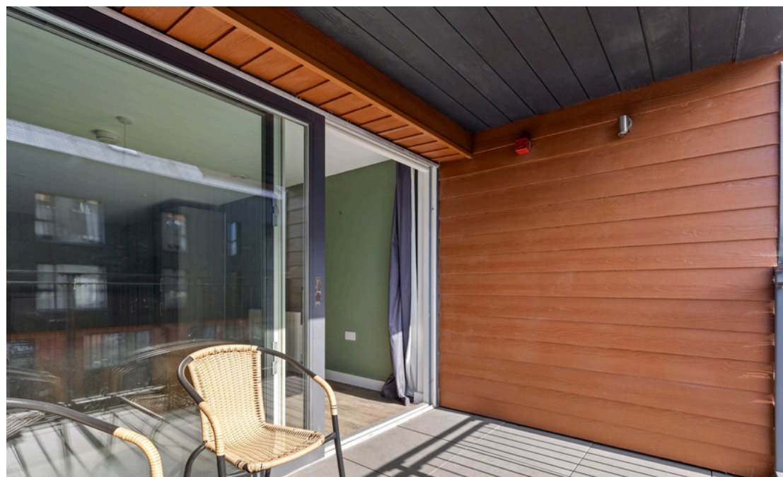
Flat 1 Artisan House, Brooks Road, Lewes 50% share - £170,000, 75% share - £225,000 of full market value - £340,000