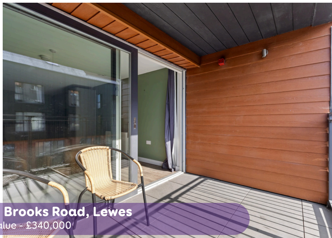
Flat 1 Artisan House, Brooks Road, Lewes Full Market Value - £340,000