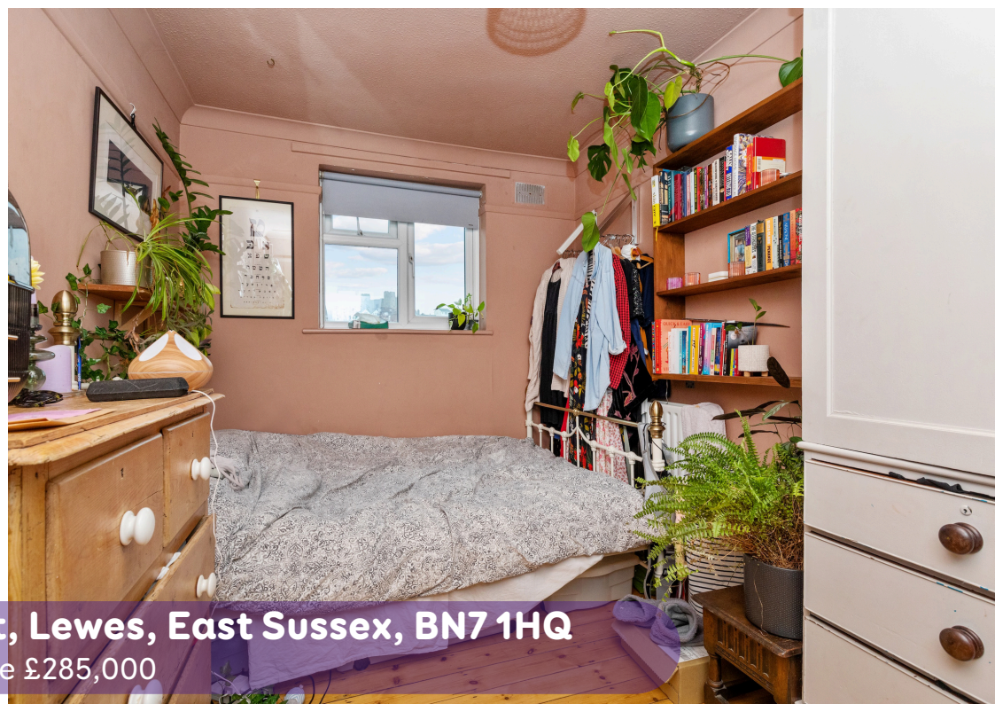
6 Priory Place Flats, Priory Street, Lewes, East Sussex, BN7 1HQ Asking Price £285,000