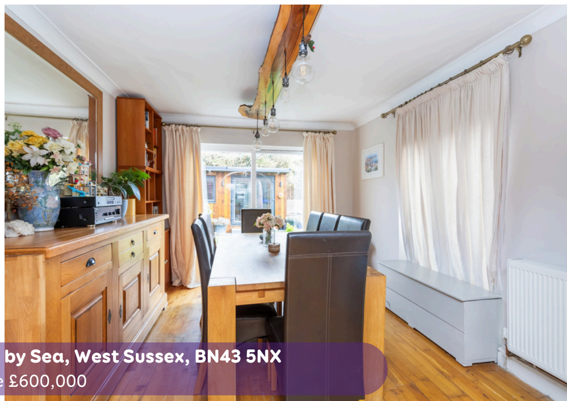
Seahaven Gardens, Shoreham by Sea, West Sussex, BN43 5NX Guide Price £600,000