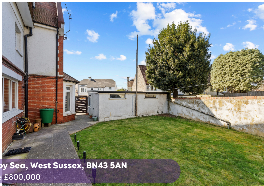
Southdown Road, Shoreham by Sea, West Sussex, BN43 5AN Guide Price £800,000