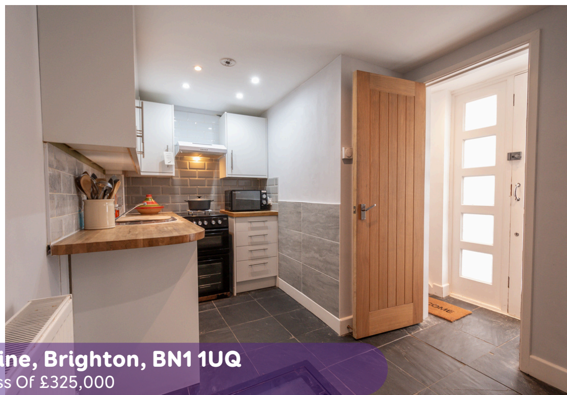
Orange Row, North Laine, Brighton, BN1 1UQ Offers In Excess Of £325,000