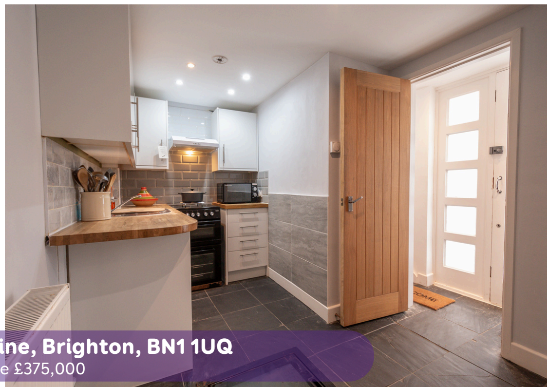
Orange Row, North Laine, Brighton, BN1 1UQ Asking Price £375,000