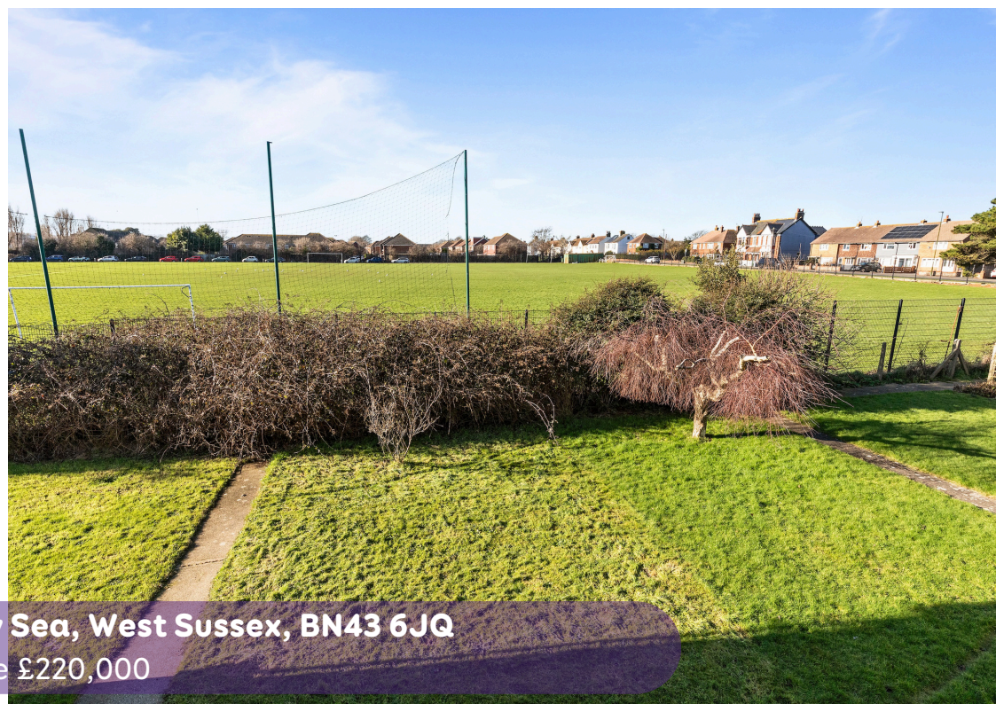
Church Green, Shoreham by Sea, West Sussex, BN43 6JQ Guide Price £220,000