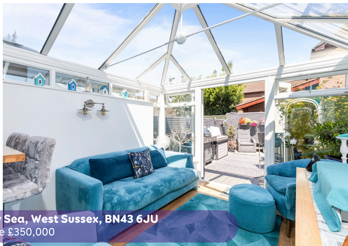
Church Green, Shoreham by Sea, West Sussex, BN43 6JU Guide Price £350,000