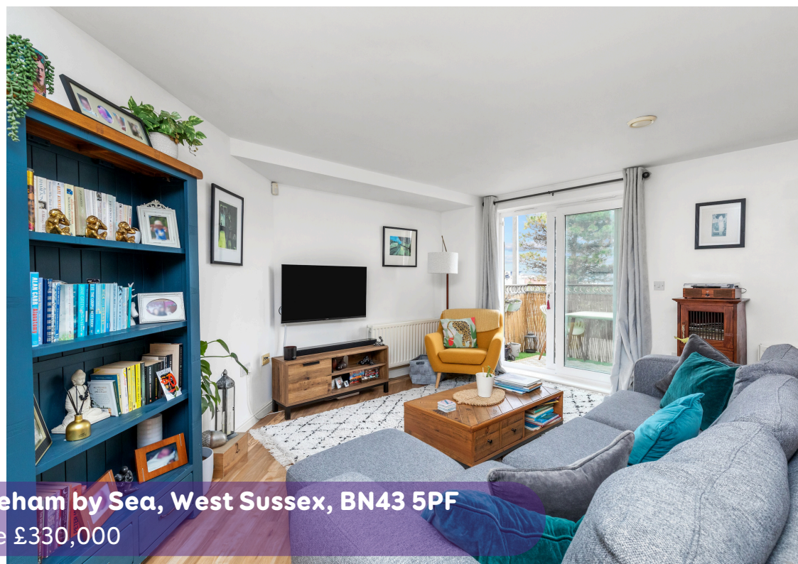
Garland Point , Sussex Wharf, Shoreham by Sea, West Sussex, BN43 5PF Guide Price £330,000