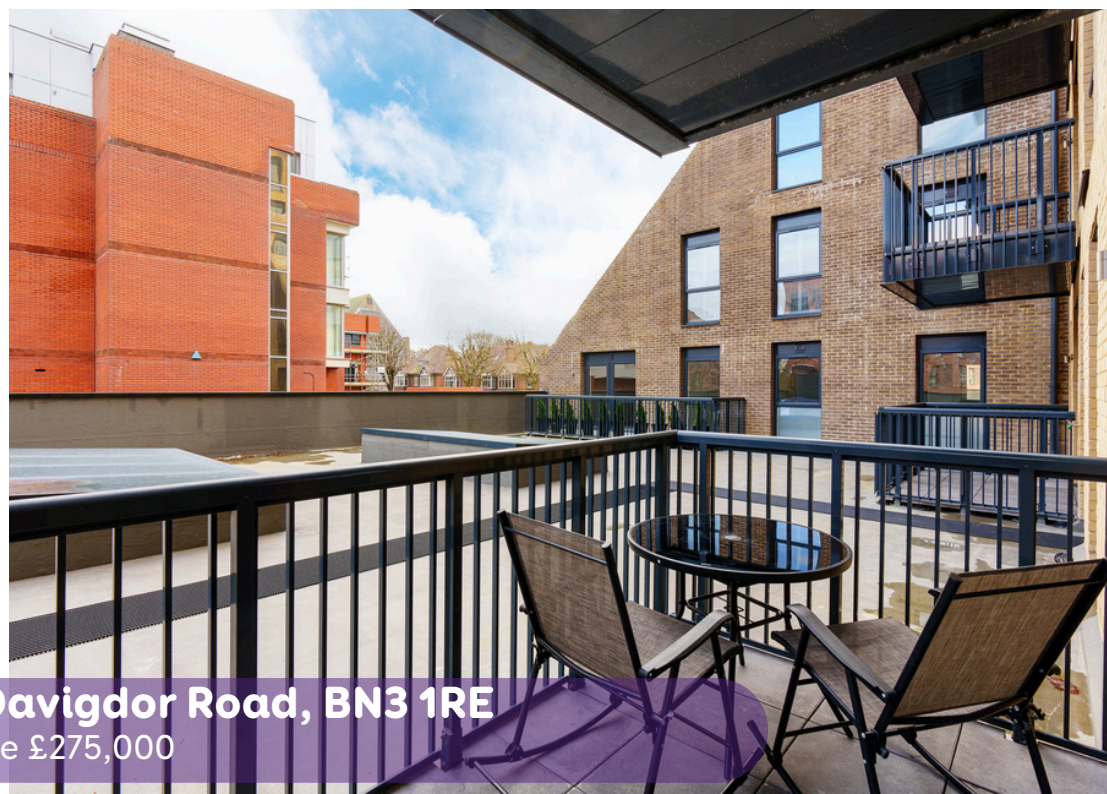
Gradino Apartments, Davigdor Road, BN3 1RE Asking Price £275,000