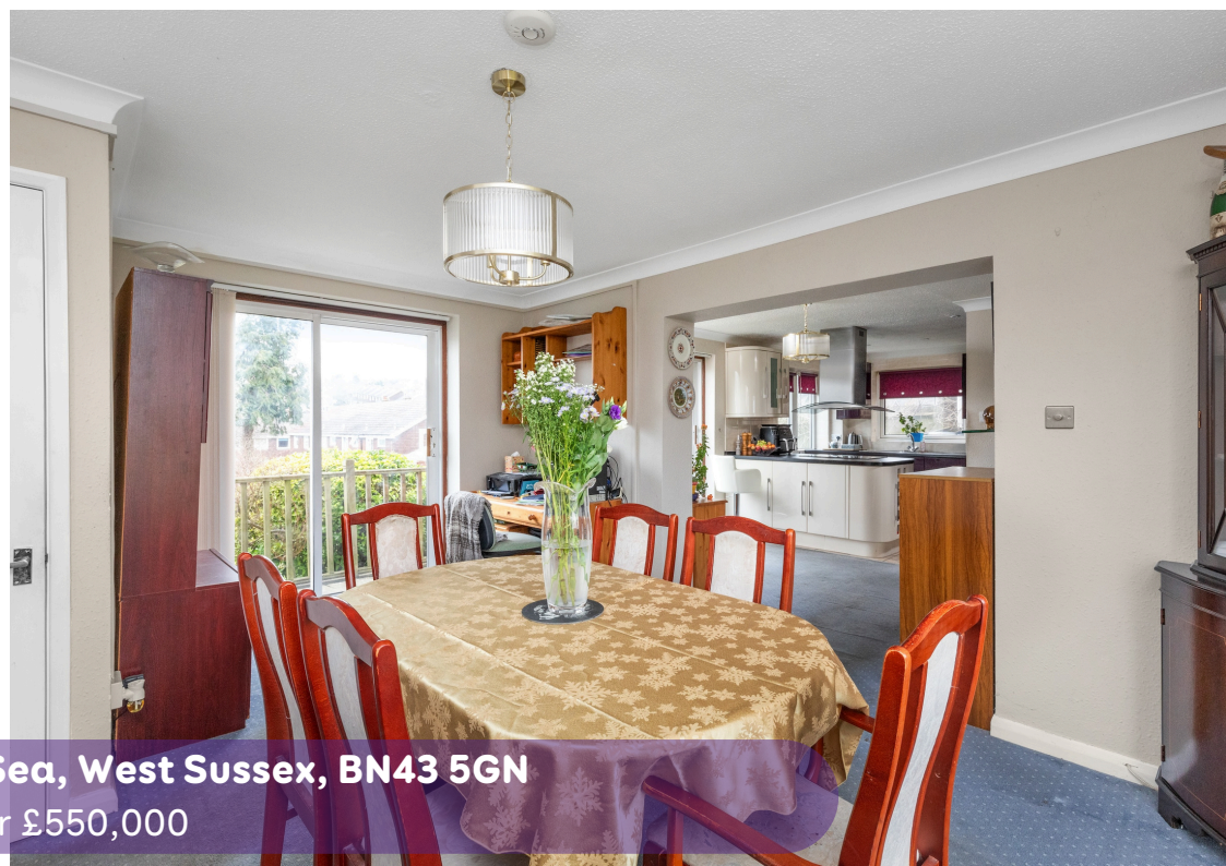
Downsley, Shoreham by Sea, West Sussex, BN43 5GN Offers Over £550,000