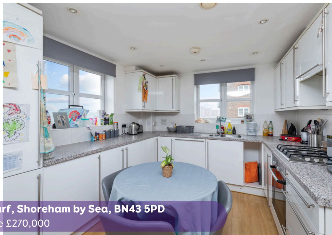
26 Sorlings Reach, Sussex Wharf, Shoreham by Sea, BN43 5PD Guide Price £270,000