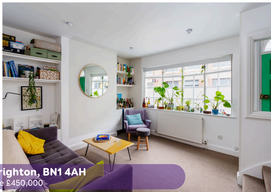
Robert Street, Brighton, BN1 4AH Asking Price £450,000