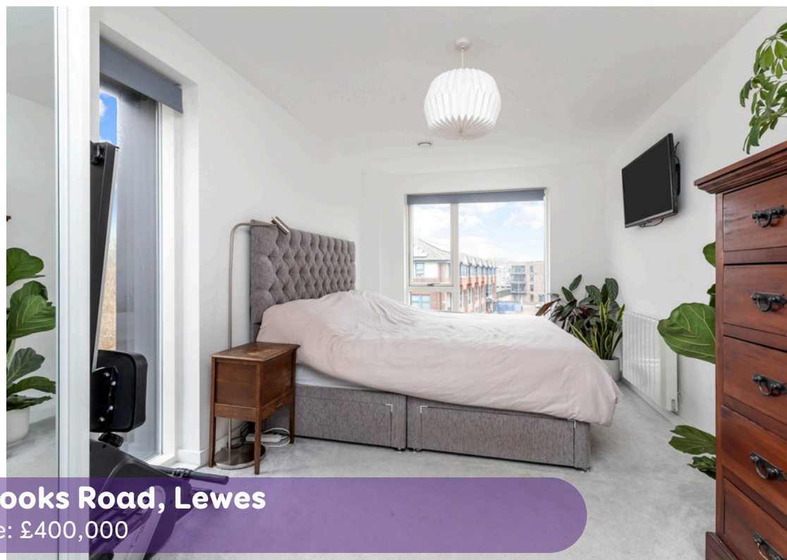
Artisan House, Brooks Road, Lewes Fixed price: £400,000