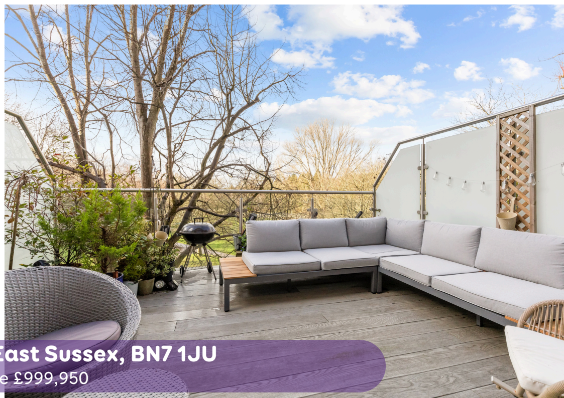
9 Bell Lane, Lewes, East Sussex, BN7 1JU Asking Price £999,950