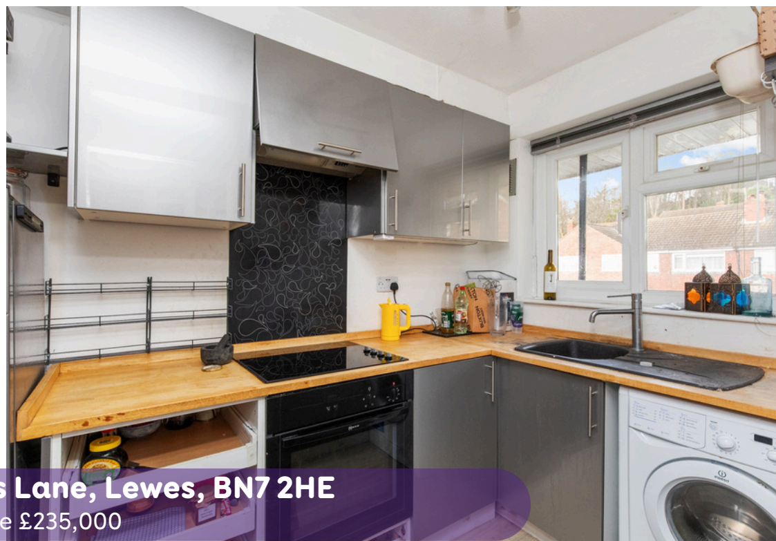
Malling Place, Spences Lane, Lewes, BN7 2HE Asking Price £235,000