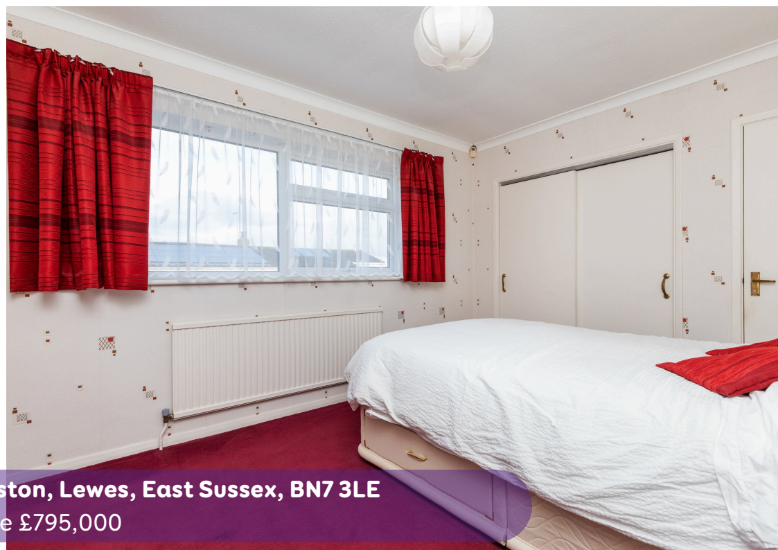
Wunmorr, Mushroom Field, Kingston, Lewes, East Sussex, BN7 3LE Asking Price £795,000