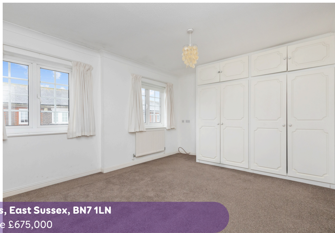
14 Cluny Street, Lewes, East Sussex, BN7 1LN Asking Price £675,000