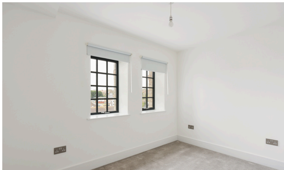
The Brewery 1881, 30 South Street, Portslade, BN41 2AQ A Guide Price of £350,000-£375,000