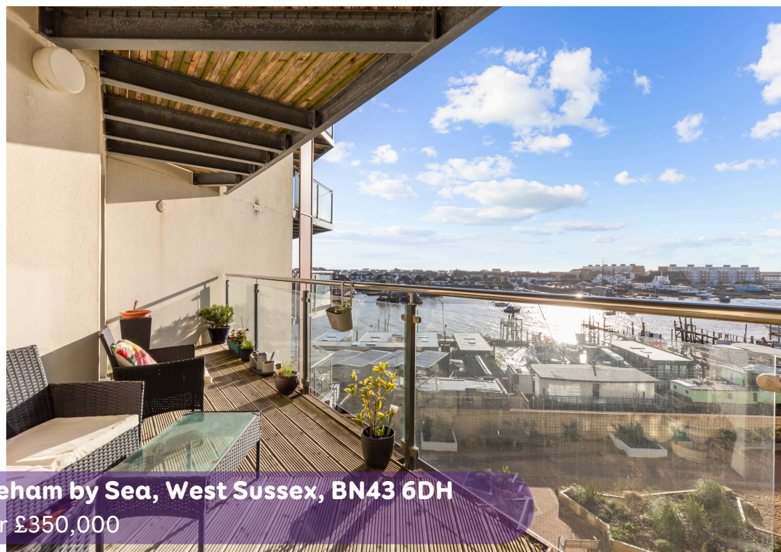
Mariner Point, Brighton Road, Shoreham by Sea, West Sussex, BN43 6DH Offers Over £350,000