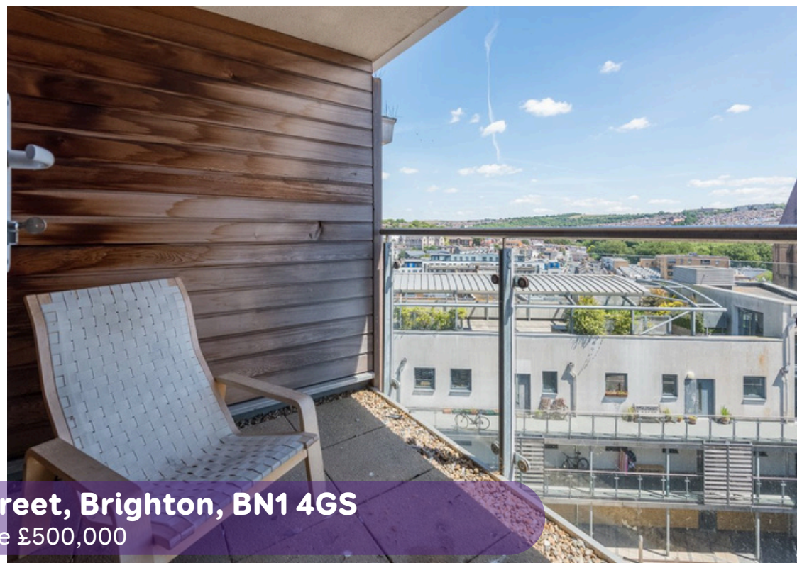
Stepney Court, Fleet Street, Brighton, BN1 4GS Asking Price £500,000