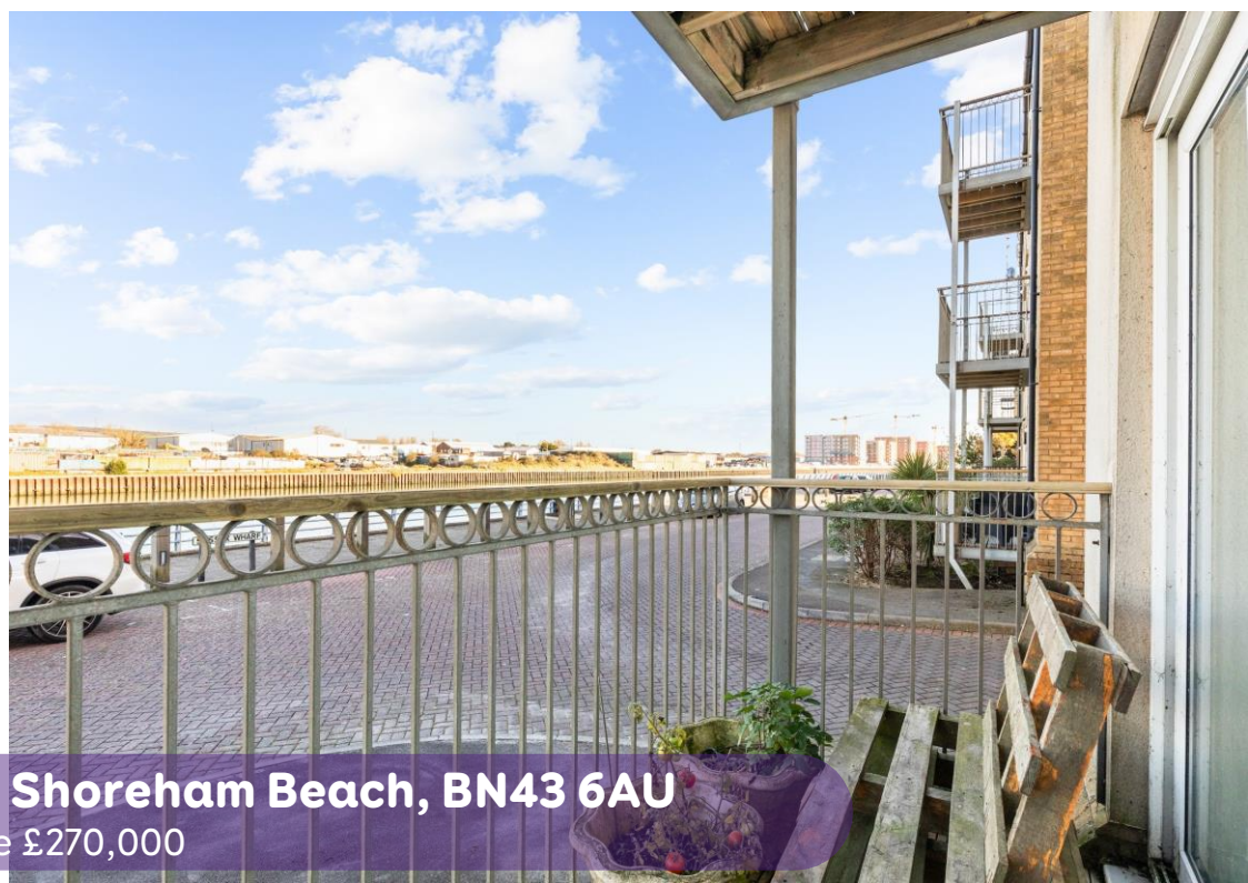
Bonaventure, Sussex Wharf, Shoreham Beach, BN43 6AU Guide Price £270,000