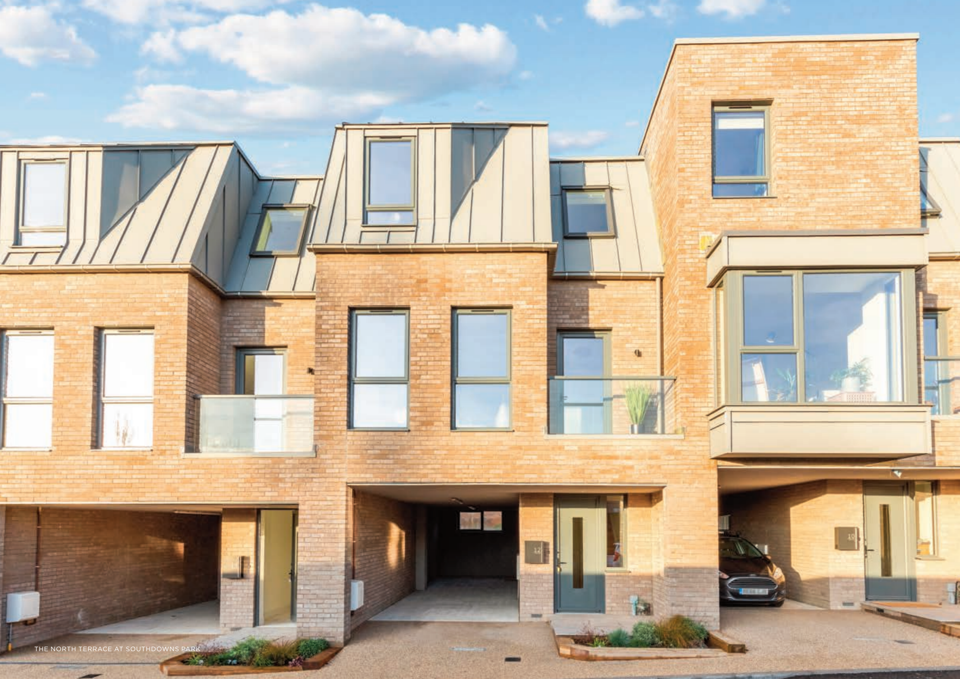
THE NORTH TERRACE AT SOUTHDOWNS PARK